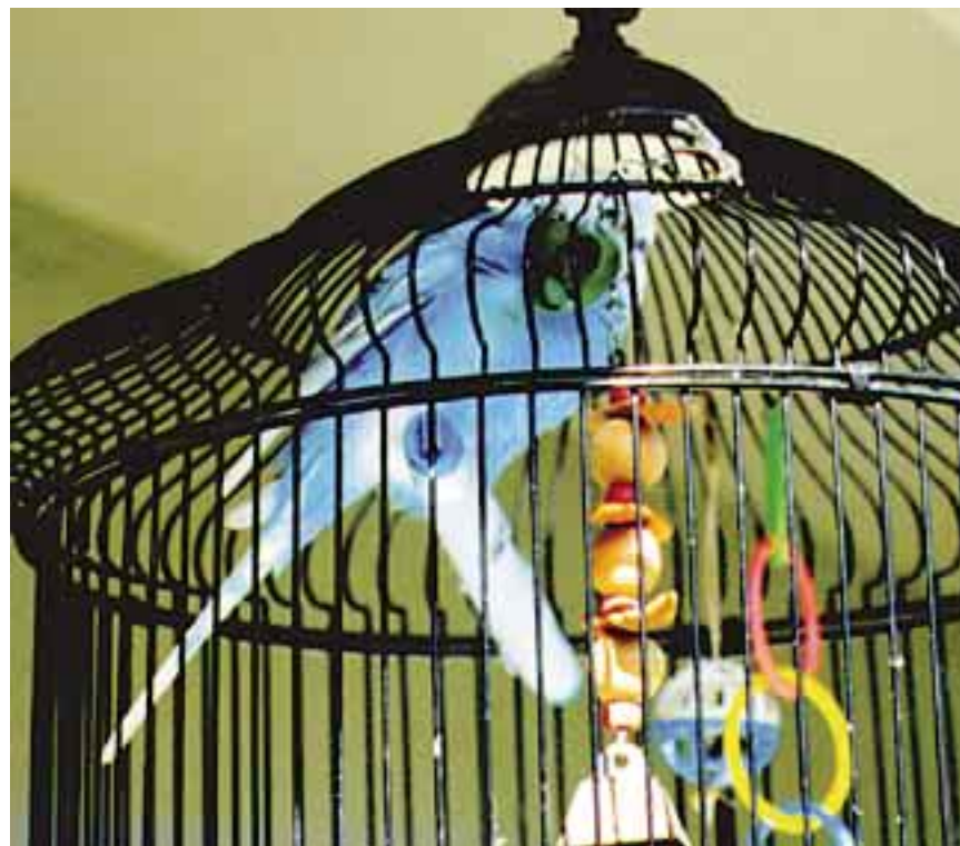
Beery ringing his bell with his right talon.